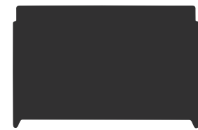
Wrench (Wrench Included)